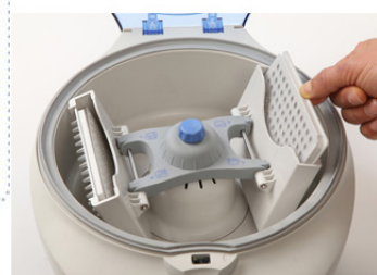
Put the PCR plate