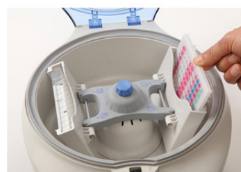
Put the PCR plate with skirt and without skirt