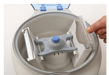
Put the ELISA plate