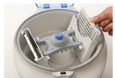
Put the 8 x 0.2ml strip of 0.2ml PCR tubes